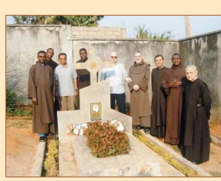
Fr. Provincial and Superiors ocd in African Mission