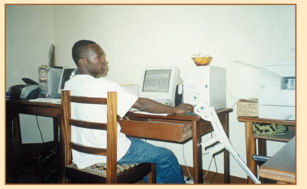
At the writing-desk after the operation

H is character was sociable, happy, humorous, he attracted children of his age, intelligent and always the first one in his class, he helped others who were not as talented as he was; brilliant in composing little poems, organizing feasts, and very much admired. To her mother, who one day expressed to him her preoccupation at seeing him always surrounded by girls, he said: "I know what you are thinking, but I can assure you that I keep intact my purity. I have prayed to Jesus for the gift of chastity and I have no doubt that I will be heard... I want to become Priest and I want to arrive pure to Priesthood."