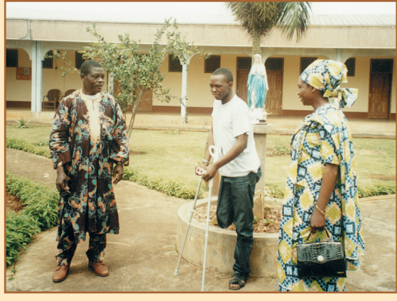
Taking leave of his parents to reach Italy